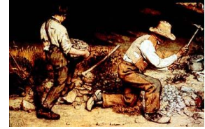
Courbet, The Stone Breakers