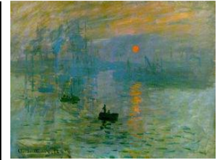
Monet, Impression Sunrise