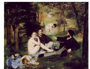
Manet, Le Déjeuner sur l'herbe