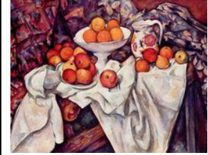
Cézanne, Apples and Oranges , c. 1899