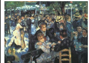
Renoir, Le Bal (Dance) au Moulin de la Galette