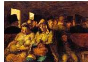
Daumier, Third Class Carriage