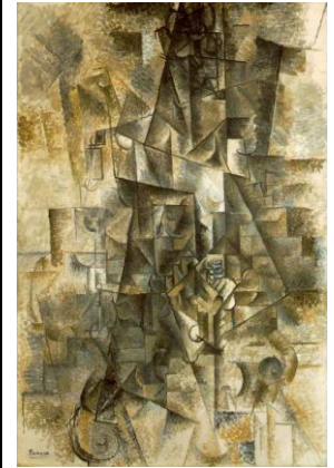
Picasso, The Accordionist , 1911