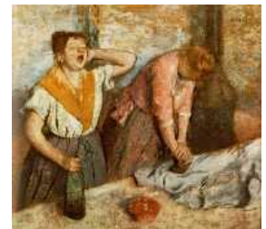
Degas, Laundry Girls Ironing