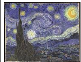
Van Gogh, The Starry Night