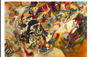
Kandinsky, Composition VII , 1913