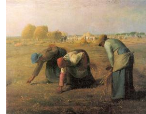
Millet, The Gleaners