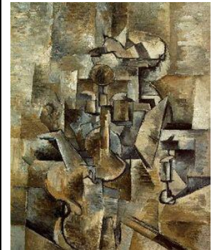
Braque, Violin and Candlestick , 1910