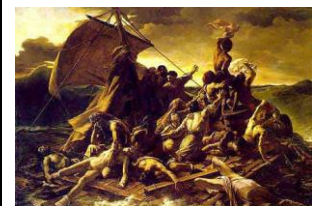
Géricault: Raft of the Medusa