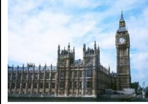
British Houses of Parliament