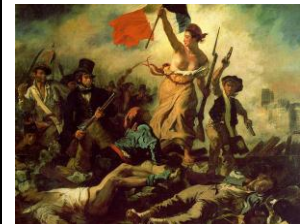
Delacroix: Liberty Leading the People